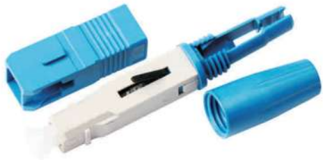
Part Number Description

F2H-FAOC-SC-A001 Field Assembly Connector,SC/APC, Preset Fiber with Matching Fluid, Buckle Type