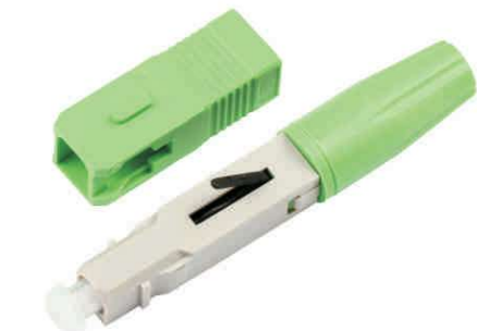
Part Number Description

F2H-FAOC-SC-E002 Field Assembly Connector,SC/UPC, Preset Fiber with Matching Fluid, Screwing Type